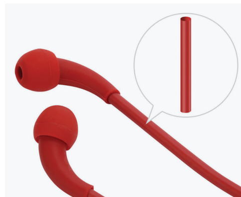
High-quality silicone air tube

The Air Tube Wireless Bluetooth headset is available in four colours - black, grey, yellow and red.